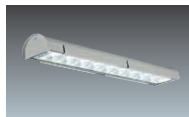
Titus Industry www.thornlighting.com/TTUI