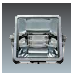
Mundial C www.thornlighting.com/MUNC